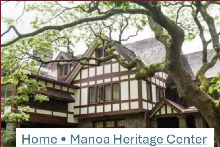
Home • Manoa Heritage Center